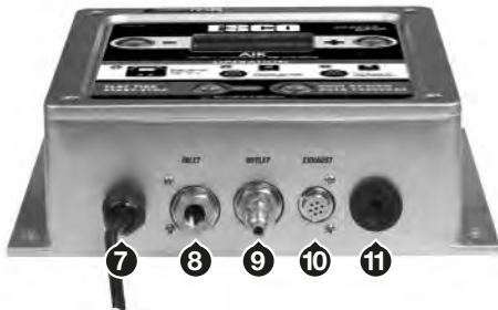
Fig. 2 Connections