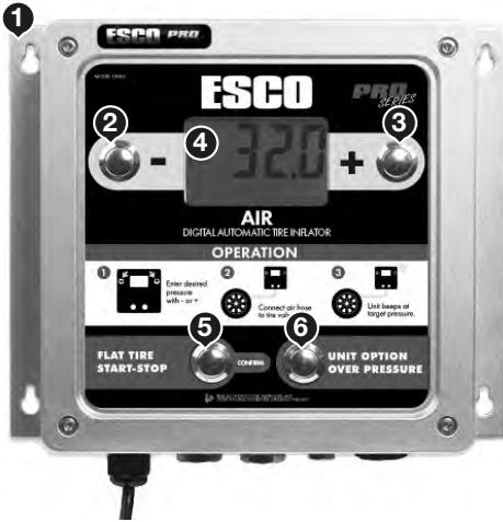
Fig. 1 Control panel