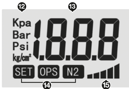
Fig. 3 Display